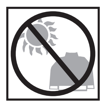
FIG. 3 Never store your Garment in direct sunlight, indirect sunlight, or in fluorescent light.