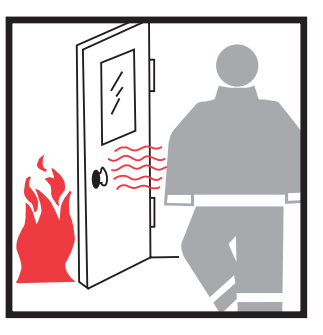
FIG. 6 Radiant heat from hot surfaces and flames can cause burns.