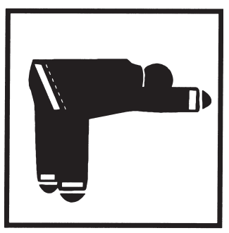
FIG. 4 NFPA Position B