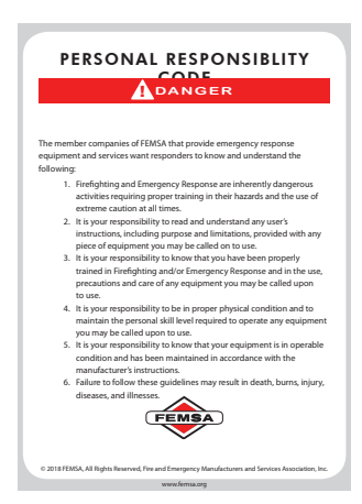
FIG. 1 Personal Responsibility Code Also shown on back cover of this Guide.